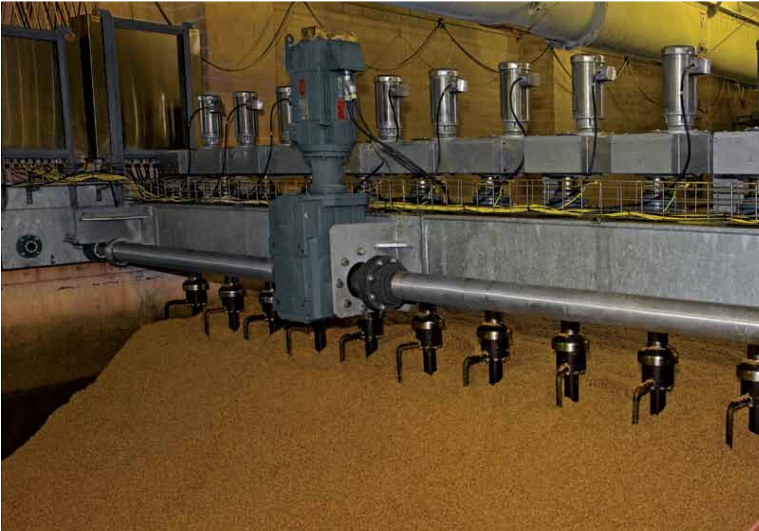
The Baldor•Reliance® SSE™ Stainless Steel Super-E® motor, with its all-stainless construction, including housing, conduit box and end plates, makes this product impervious to rust and deterioration caused by high-pressure sanitizing. Premium external and internal bearing protection prevents water from entering the motor. Encapsulation using Baldor's E3 Effusion Epoxy Encapsulation™ process on the windings adds another level of moisture protection. The Dodge® Quantis® E-Z Kleen gear reducer is manufactured with a 13-step coating system that provides greater than three times the corrosion resistance of standard epoxy-painted units. E-Z Kleen reducers have a two-piece, harsh-duty sealing system that protects against high-pressure sprays and sanitizing solutions.

Malt is a processed form of barley and is one of the basic ingredients used to brew beer. Often referred to as the “soul” of beer, malt provides most of the complex carbohydrates and sugars needed to give this beverage its distinctive flavor and color. The Malteurop Group, the world’s leading malt producer headquartered in Reims, France, has perfected the precise control required to produce premium quality malt barley.