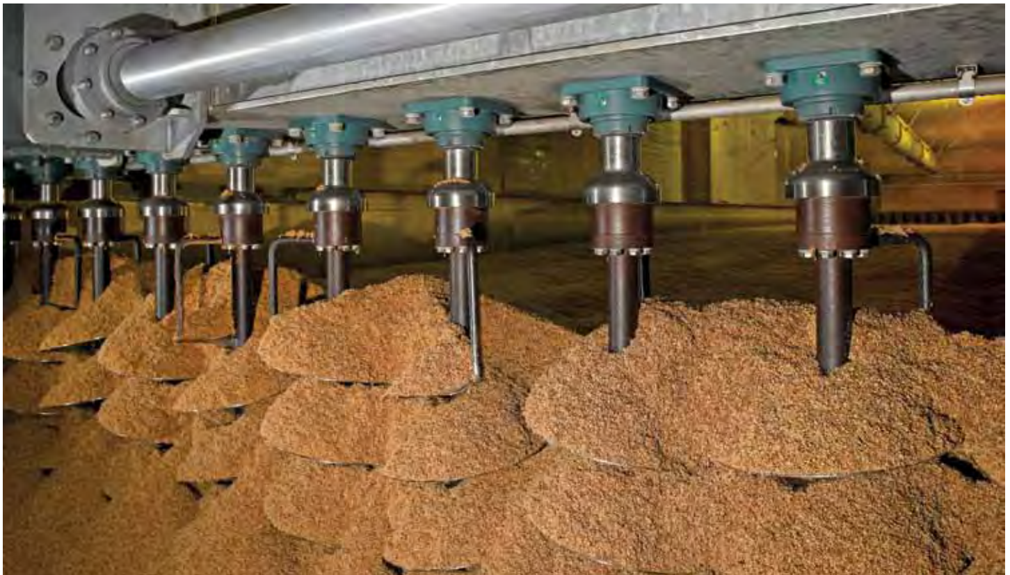
The Malteurop team selected Dodge Imperial roller bearings because of the patented triple-lip contact sealing system that prevents water and other contaminants from entering the bearing. The team is also pleased with the adapter mounting system that makes these bearings easy to install and remove.

“This stainless motor is designed to perform in harsh conditions longer than anything else available today,” says Glynn. “And, to make sure we could get the right reducer to fit, Dodge sales engineer Brian Koch helped us with a design for the Dodge Quantis E-Z Kleen. And just like the bearing test, we placed a plate from the unit in the environment to prove that the reducers’